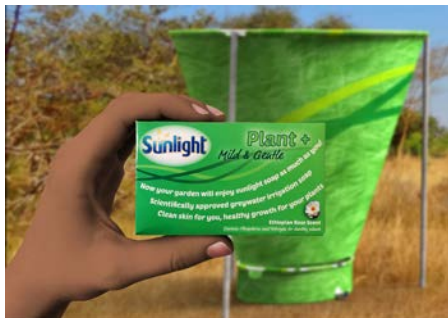
Fig 1. Sunlight, Plant+ Brand

The "Save" bathing station is part of a greywater irrigation system that has been frugally designed to help the people of Sub Saharan Africa reap the benefits of the missed opportunity that is, greywater irrigation. This concept addresses a number of issues that were uncovered through primary research. This was developed in part as a result of focus group sessions, particularly in discussions with men and women originally from Zimbabwe and Ethiopia. Wastewater - greywater - produced as a result of bathing is often discarded, as it is believed to be harmful to plants. Greywater from bathing can actually be more beneficial than regular water for irrigation as it often contains nutrients such as phosphorus and nitrogen. These ingredients are also found in fertilizer. The concept addresses the needs of users. It addresses some fundamental matters around privacy when bathing, plant irrigation and subsistence living whilst facilitating the promotion of a soap brand. "Plant+" is a slightly adjusted formula containing boosted amounts of plant nourishing ingredients. This brand will be marketed especially for use with greywater irrigation and increase the positive brand association with Unilever through encouraging small behaviour change that brings benefits for the user and community.