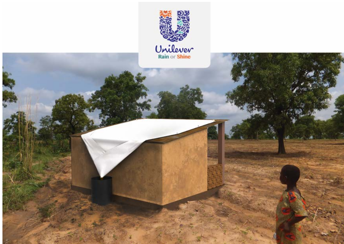
Fig 4. Rain Shine Pack - domestic setting.

net result offers some impact on water collection coupled with a lighting power source thereby impacting on communities struggling to break a poverty cycle.