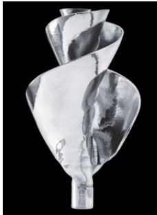
Figure.5 Lily impeller.

The Lily impeller ( http://www.paxwater.com/impeller-mixers ) is a spiral shaped mixer designed to be put in water tanks to induce a whirling movement to the stored water in order to avoid its thermal stratification. Its design has been inspired by the spiraling shape of the lily and wants to mimic the effect of ocean whirlpools.