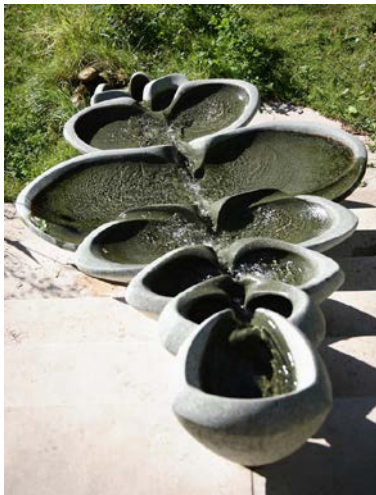
Figure.1 Flowform Vortex Garten Darmstadt.

The Flowform™ Technology consist of a set of containers with particularly shaped walls that enable the water flowing through them to move in a spiraling way making eight-shaped forms. The design of flowform emerged from a deep observation and understanding of water's natural behavior and the recognition of the essential rhythm carried by water: flowforms are shaped to enable water to replicate its natural movement and to regain its characteristic rhythm, which is at the basis of its life giving properties. The beneficial effects of this revitalized water have been demonstrated in different fields of application that go from health to agriculture (Schwuchow et al., 2010).