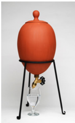
Figure.3 Water egg.

http://www.iwateregg.com/product/product.html