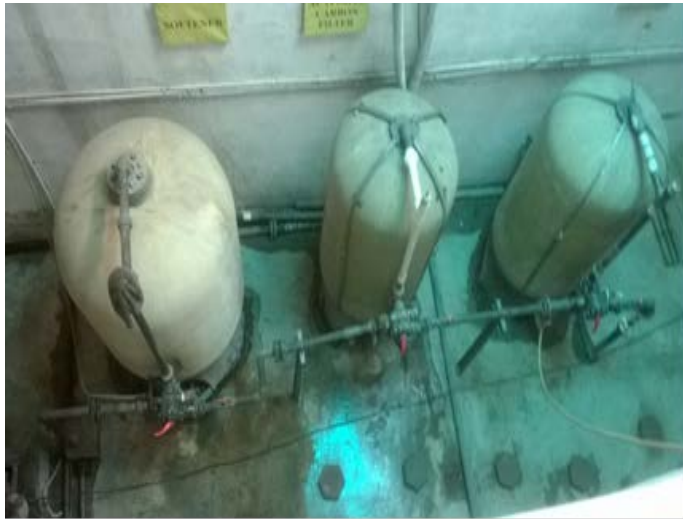
Figure. 7 Dual Media, Activated Carbon and Softener chambers

# Softener chamber: Finally the water passes through the softener chamber to remove the hardness of water.