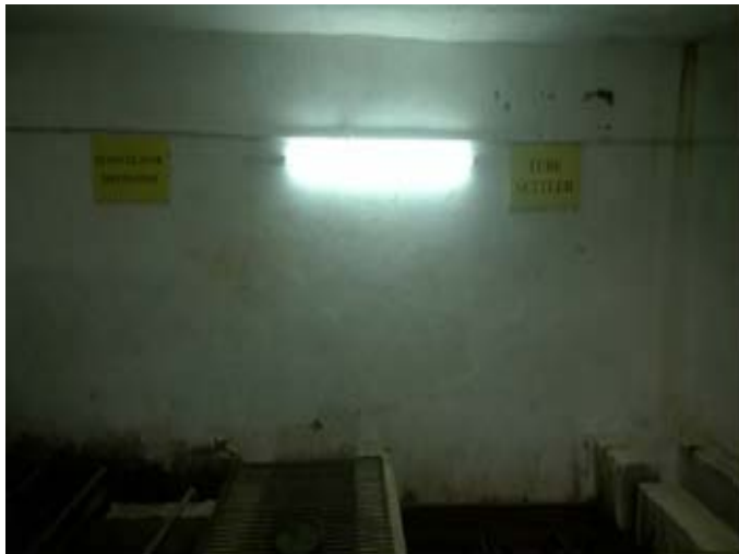
Figure. 6 Flocculation and tube settler tank

Then this treated water is passed through trickling filter which is a bed coarse stone over which the waste water is sprayed.