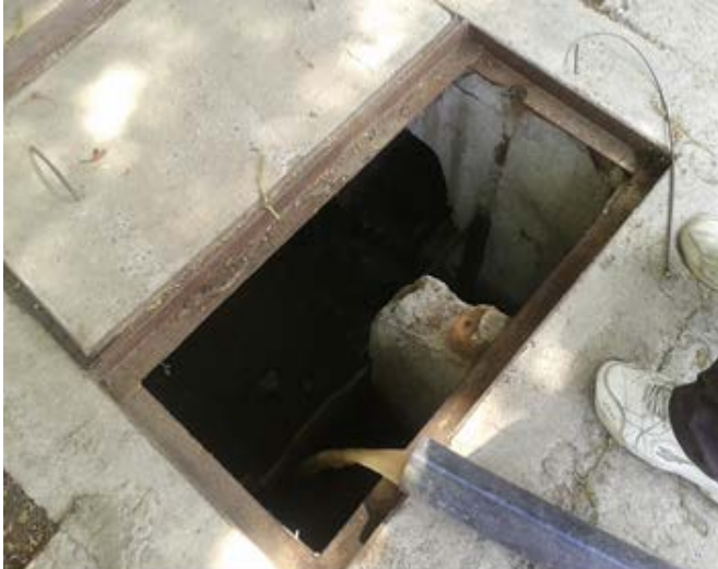
Figure.2 Screening Chamber

The water flowing from the Bathrooms, kitchen sinks and washes basin flow down the drain from all the houses/flats and collects in a bigger underground drain and then flow into the screening chamber through the bar screen where the waste water is cleared of polythenes, cotton bud, wipes, broken bottles and rags (Figure 2) that might block or damage the equipment in further processing.