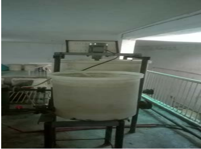
Figure . 5 Poly Aluminum Chloride and Polyelectrolyte tank

Then this treated water is passed through trickling filter which is a bed coarse stone over which the waste water is sprayed.