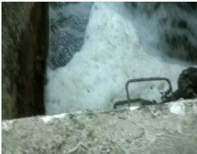
Figure . 4 Bacterial actions on sludge

BOD is the amount of oxygen required per liter of wastewater to decompose the organic pollutants by bacteria.