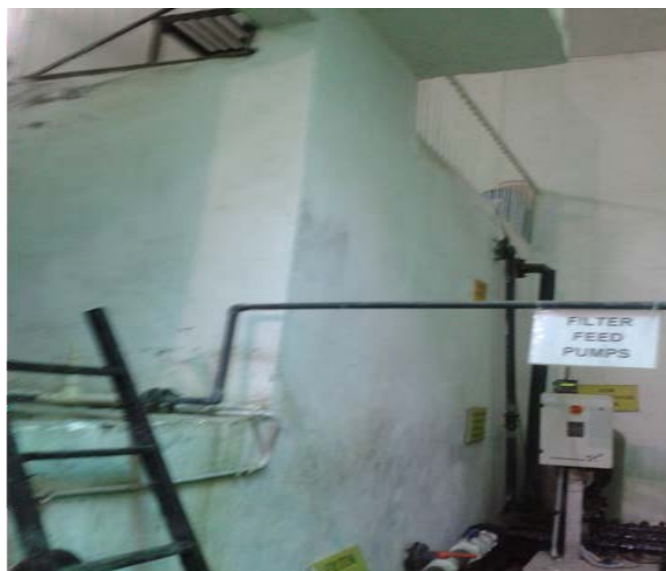
Figure.8 Feeder tanks

The water now almost free of harmful substances is stored in large Feeder tanks -Figure 8