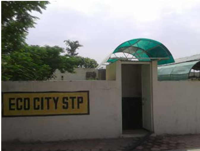
Figure.1 STP Plant-Outer View

simultaneously. The various stages of treatment are as follows: