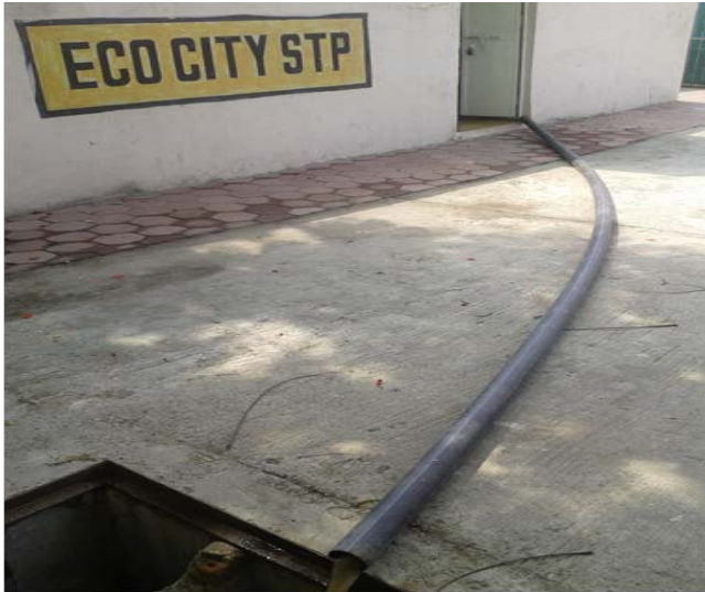
Figure.9 Unpurified water drained back

The treated water is then recycled back to the residents in separate tanks for toilets usage. This recycled water is also used for watering and maintaining greenery in the society.