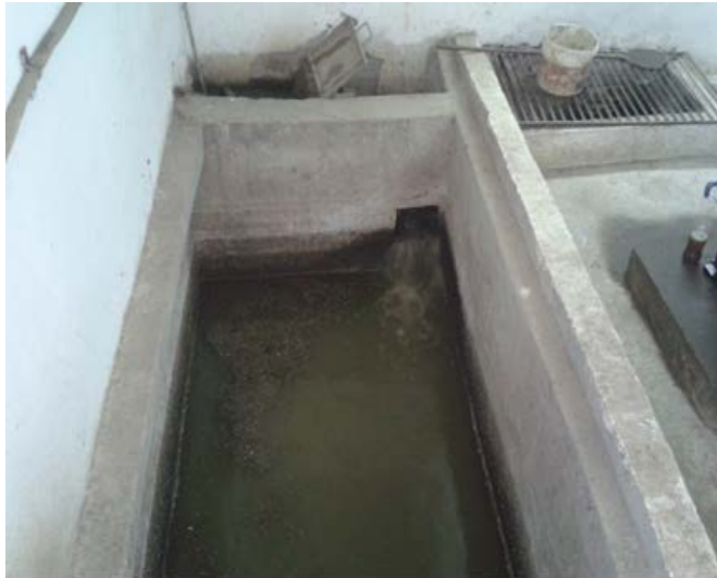
Figure.3 Primary sedimentation tank